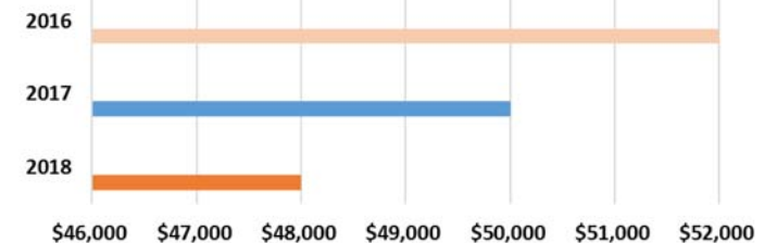
Grants to Masooli Clinic 2016 through 2018 (projected)

■ Grants to Masooli Clinic ■ Administrative Expenses