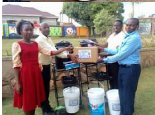
Above, clinic staff provides health education to students in community schools along with basic health and wellness supplies.

Eight school partnerships were in place by the end of second quarter 2023. Hundreds of students are being reached.